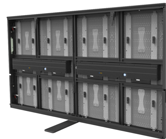
modular cabinet 800x900mm, feet, top cover, fast installation